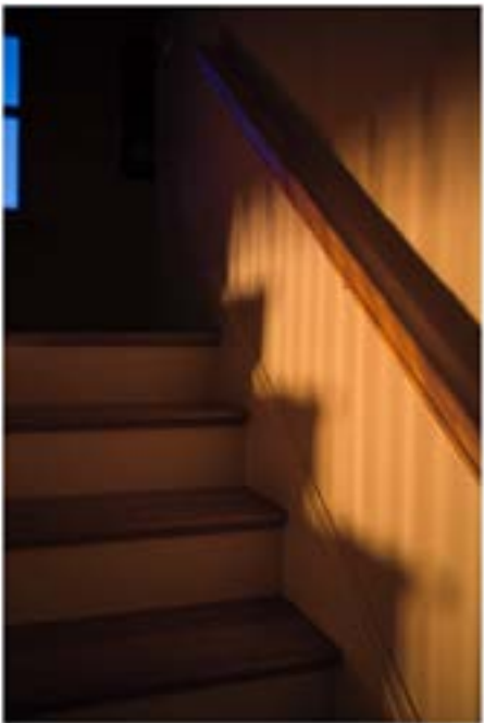
Winter Water , 2019