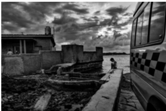
A boy in solitude, Santa Fé, Cuba, 2019 18 x 27 on 21 x 30 paper