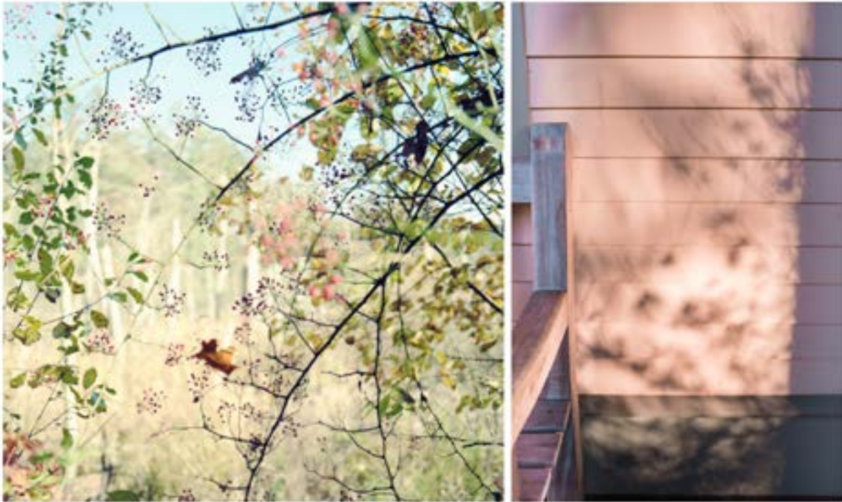
Big Pink , 2020