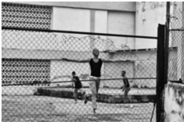
A boy flies, Havana, Cuba, 2016 18 x 27 on 21 x 30 paper