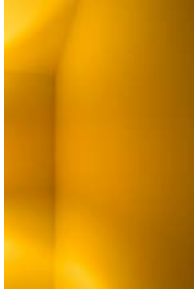
Atomic Tangerine , 2018