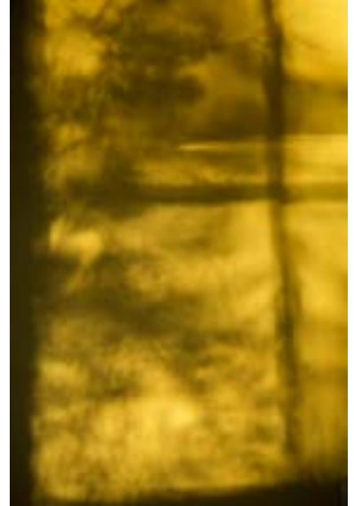
Sunglow , 2018