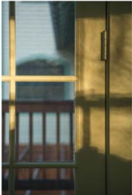
Tide Marker , 2019