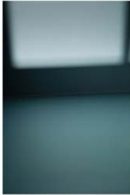
Boardwalk , 2019