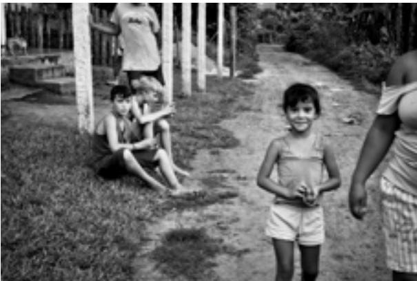
Young girl with two eggs, Viñales, Cuba, 2015 14 x 21 on 17 x 24 paper