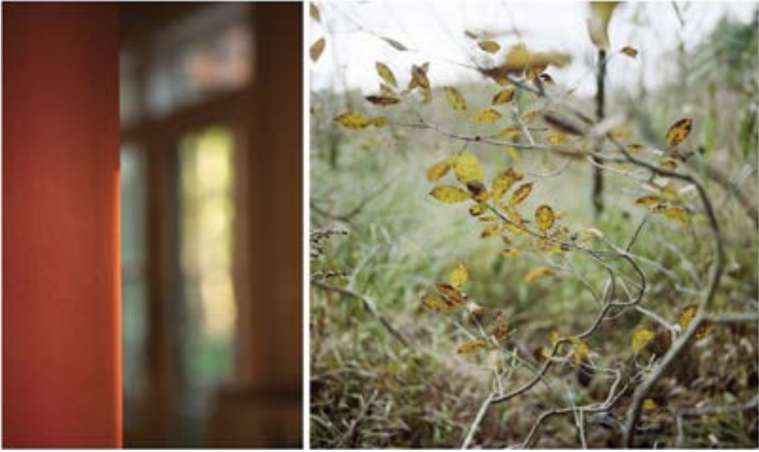
Last Light , 2019