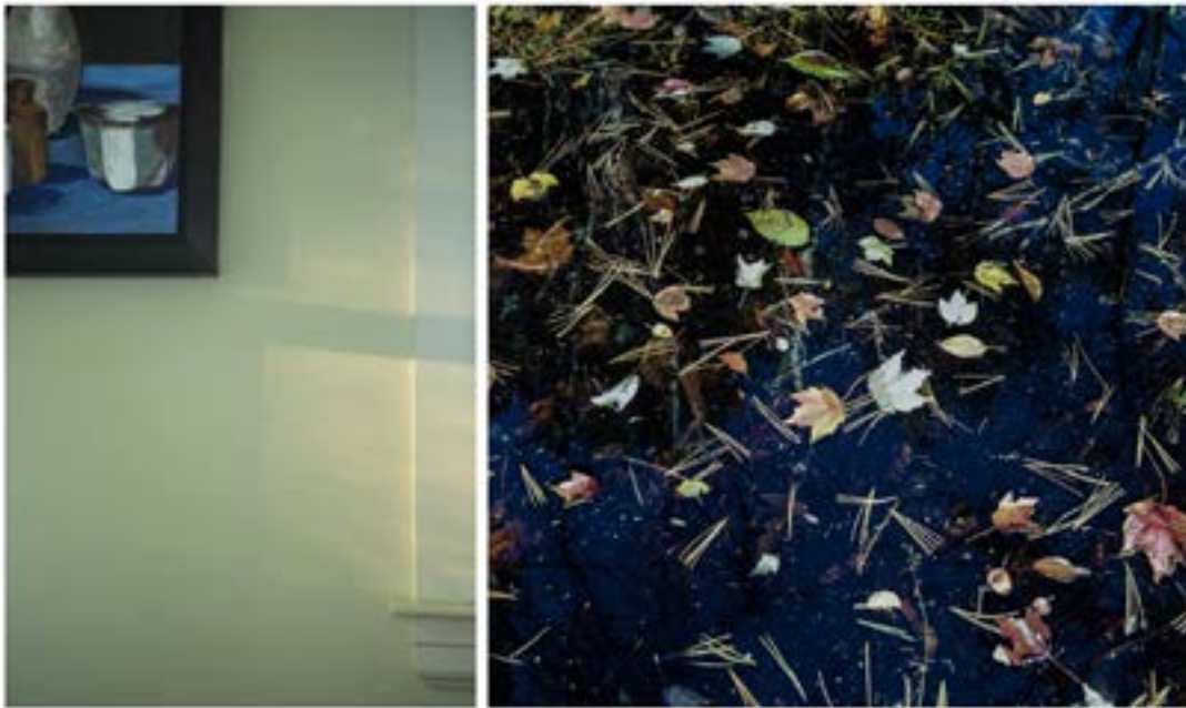
Floating , 2019