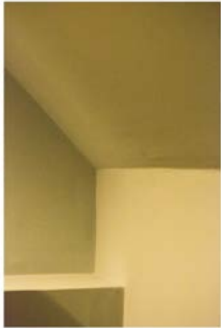
Driftwood , 2019