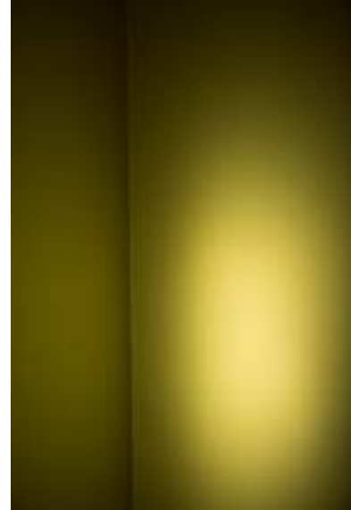
Avocado , 2018