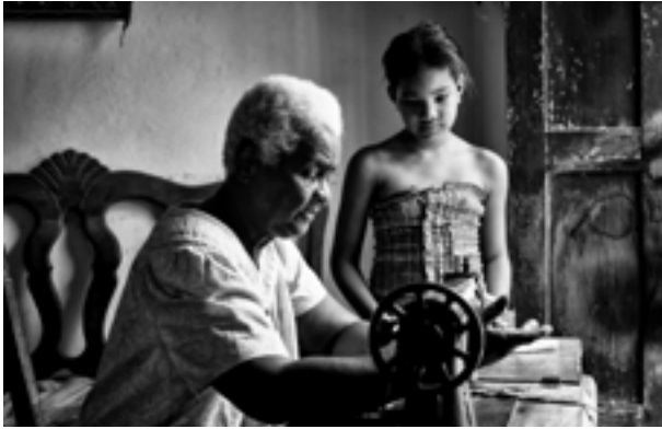
For 100 years, Trinidad, Cuba, 2016 14 x 21 on 17 x 24 paper