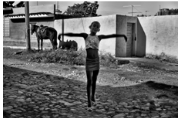
Niña, rising, Trinidad, Cuba, 2015 14 x 21 on 17 x 24 paper