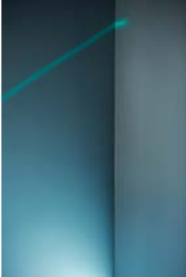
Turquoise , 2018