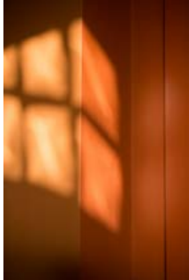
Crimson , 2018