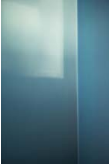
Cerulean , 2018