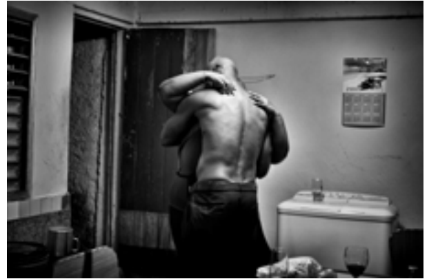
Love in the kitchen, Trinidad, Cuba, 2018 14 x 21 on 17 x 24 paper