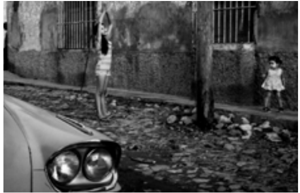
A magical corner, Trinidad, Cuba, 2017 14 x 21 on 17 x 24 paper