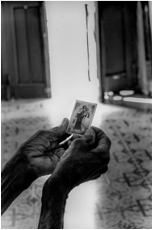
Santa Carmen in Carmen's hands, Sancti Spíritus, Cuba, 2018 14 x 21 on 17 x 24 paper